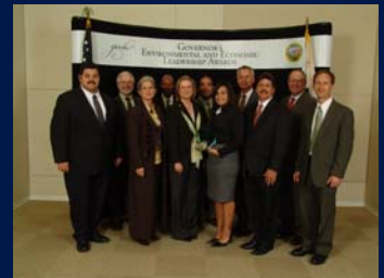
2008 Governor's Environmental & Economic Leadership Award - Climate Change