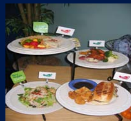
First student dining program to label food entree's carbon footprints