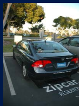
First carshare program in Orange County, CA