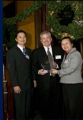
2008 Flex Your Power Award – Best Overall