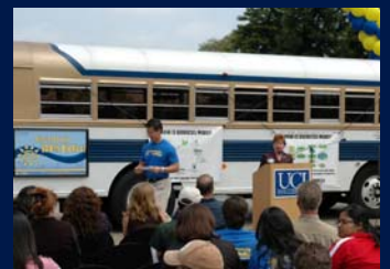
First bus fleet in the U.S. to run entirely on bio-fuel