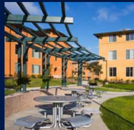
First LEED Gold Award in Orange County, CA