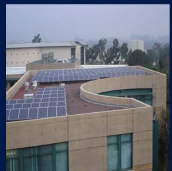
Rooftop photovoltaic system